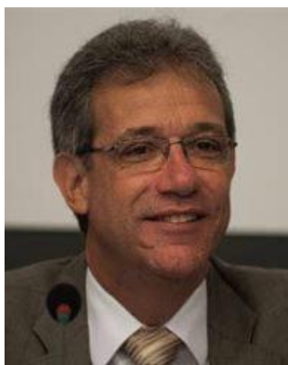
Ademar Arthur Chioro dos Reis